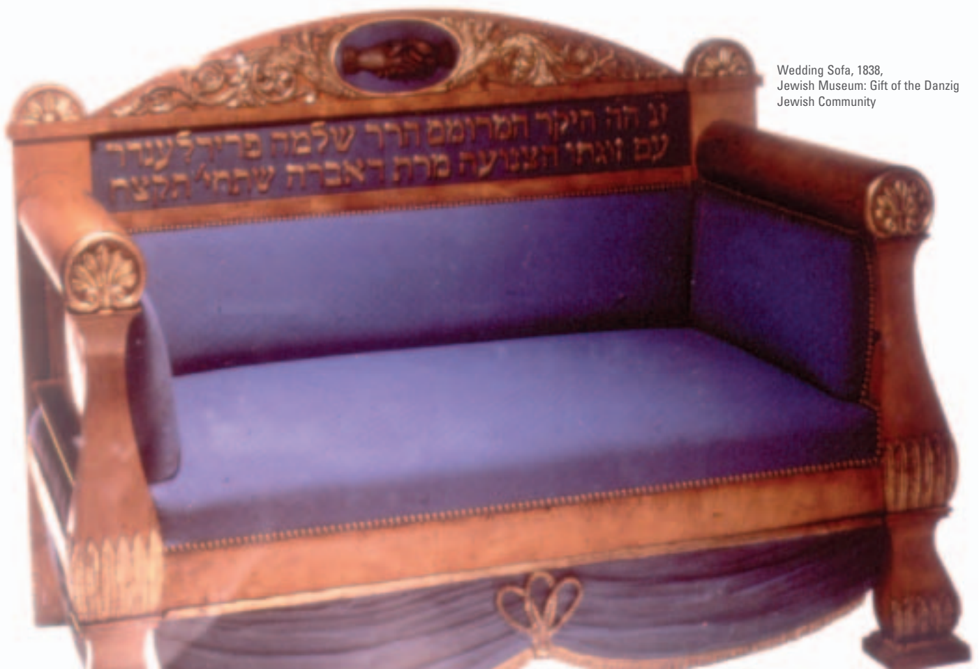
Wedding Sofa, 1838, Jewish Museum: Gift of the Danzig Jewish Community