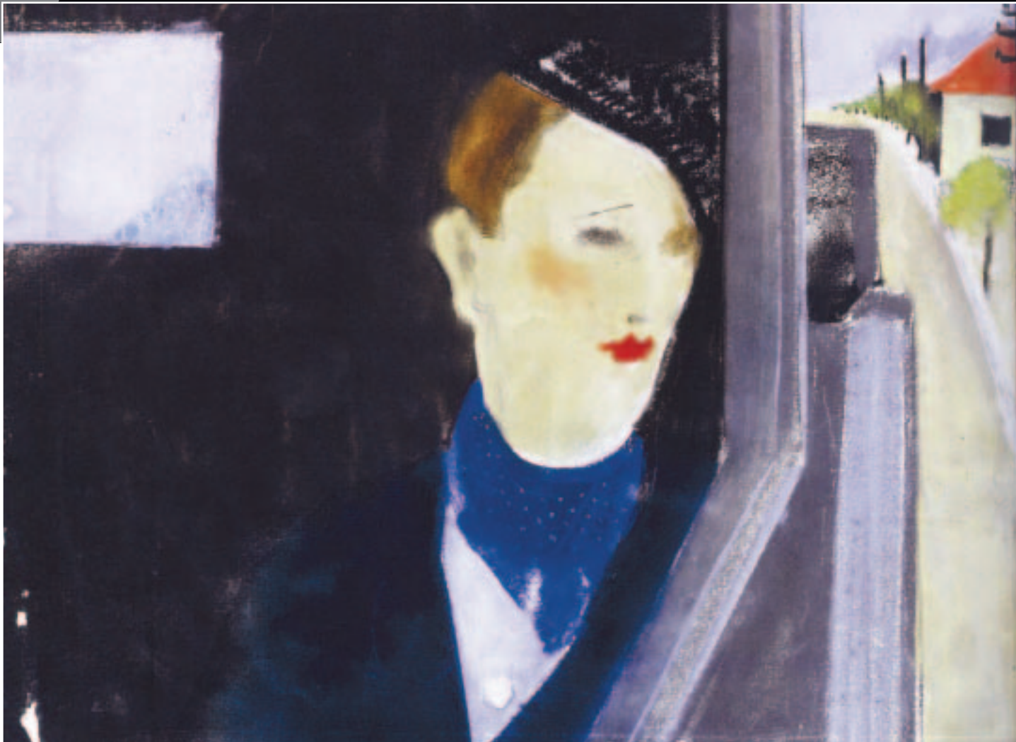
Friedl Dicker-Brandeis, Lady in a Car , 1940, pastel on paper, Jewish Museum, Prague

F riedl Dicker was born to a Jewish family in Vienna, Austria, in 1898. After completing her art studies at the Bauhaus school in Weimar, Germany in 1923, she spent a year in Berlin and then returned to her hometown of Vienna. Friedl spent 10 years in Vienna working as an artist, designer, and art teacher. In her teaching, Friedl combined her boundless artistic creativity with the lessons about making art that she had learned from her own teachers.