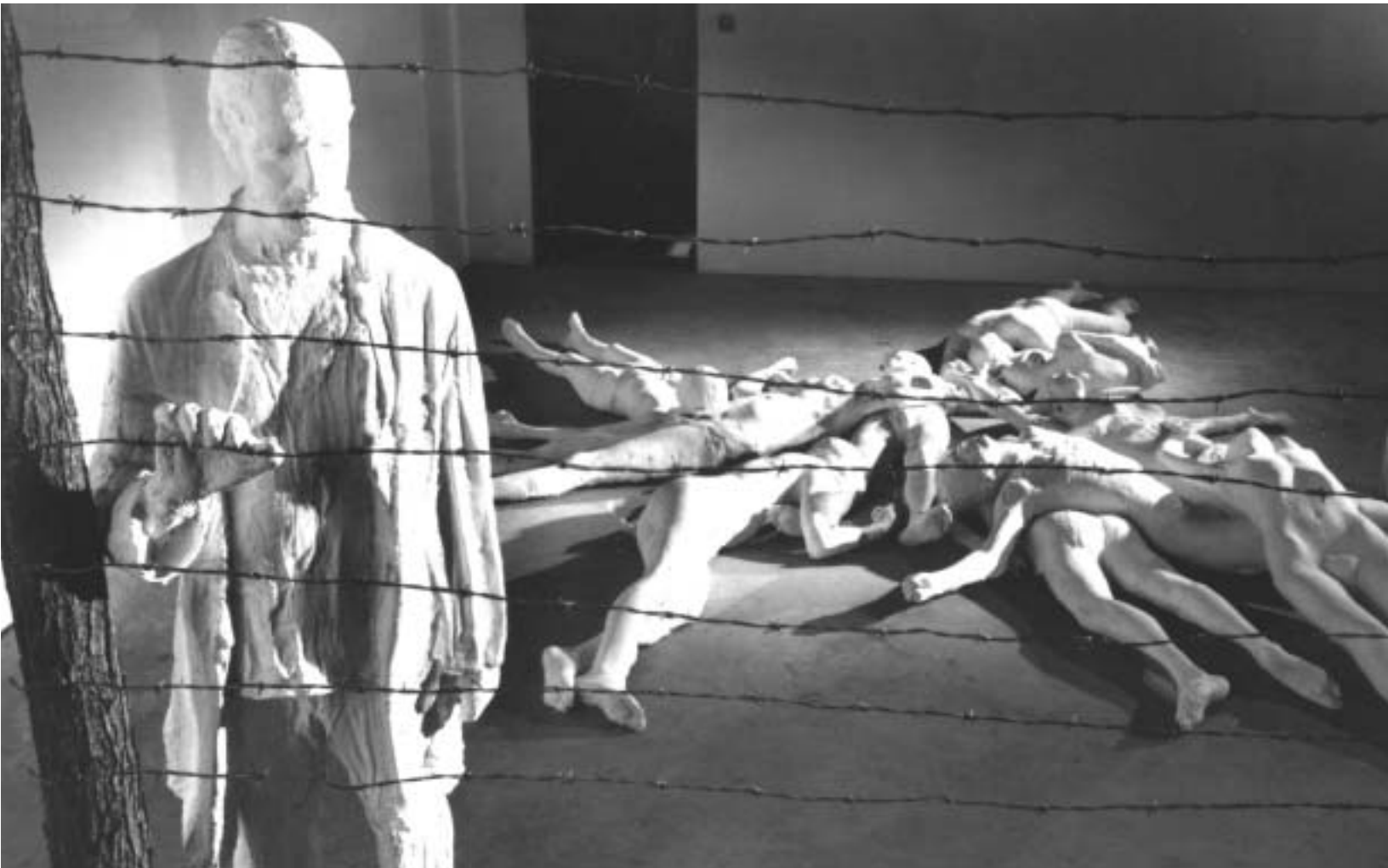
George Segal, The Holocaust, 1982. Plaster, wood, and wire. The Jewish Museum: Purchased: Dorot Foundation gift

(From the "Jewish Virtual Library" www.jewishvirtuallibrary.org/jsource/Holocaust/salonika.html )