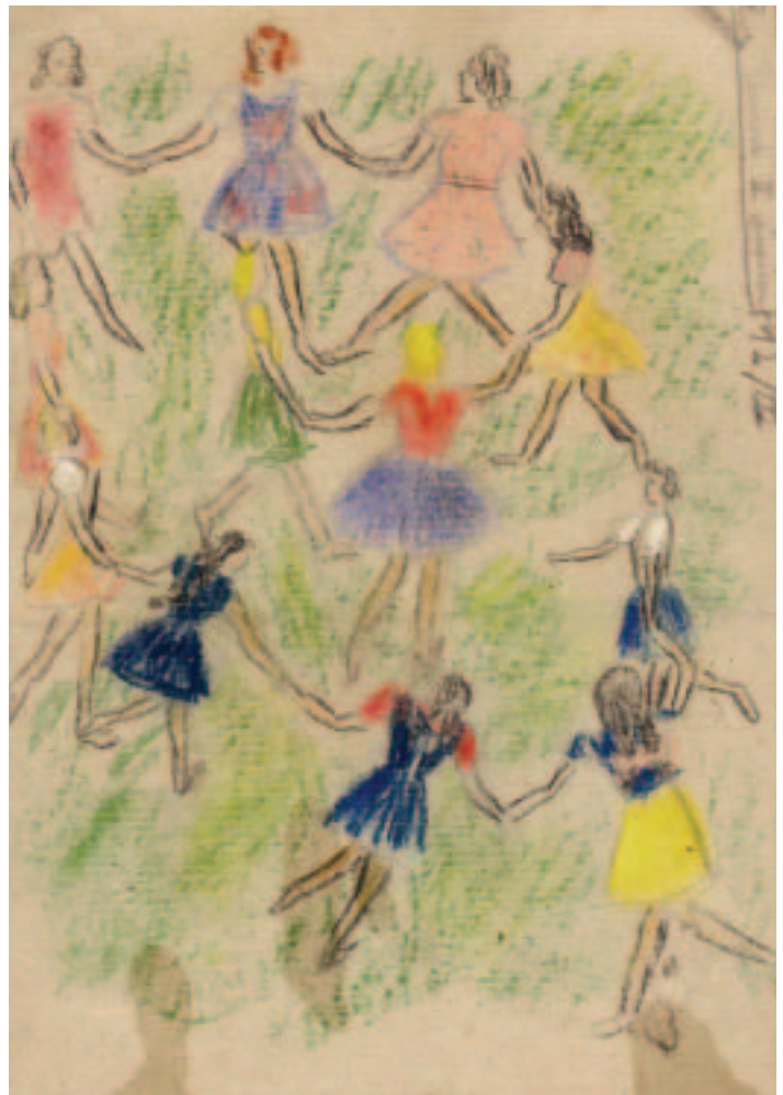
Eva Schurova, Untitled , pastel on paper, Jewish Museum, Prague